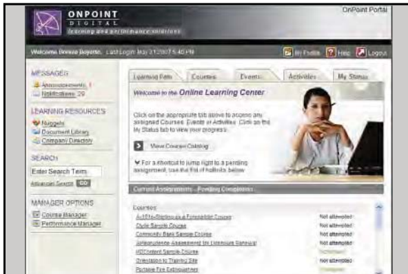
OnPoint Portal Interface Screen