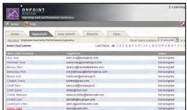
OnPoint Performance Manager Screen