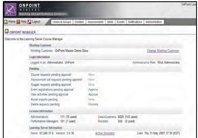
OnPoint Course Manager Screen